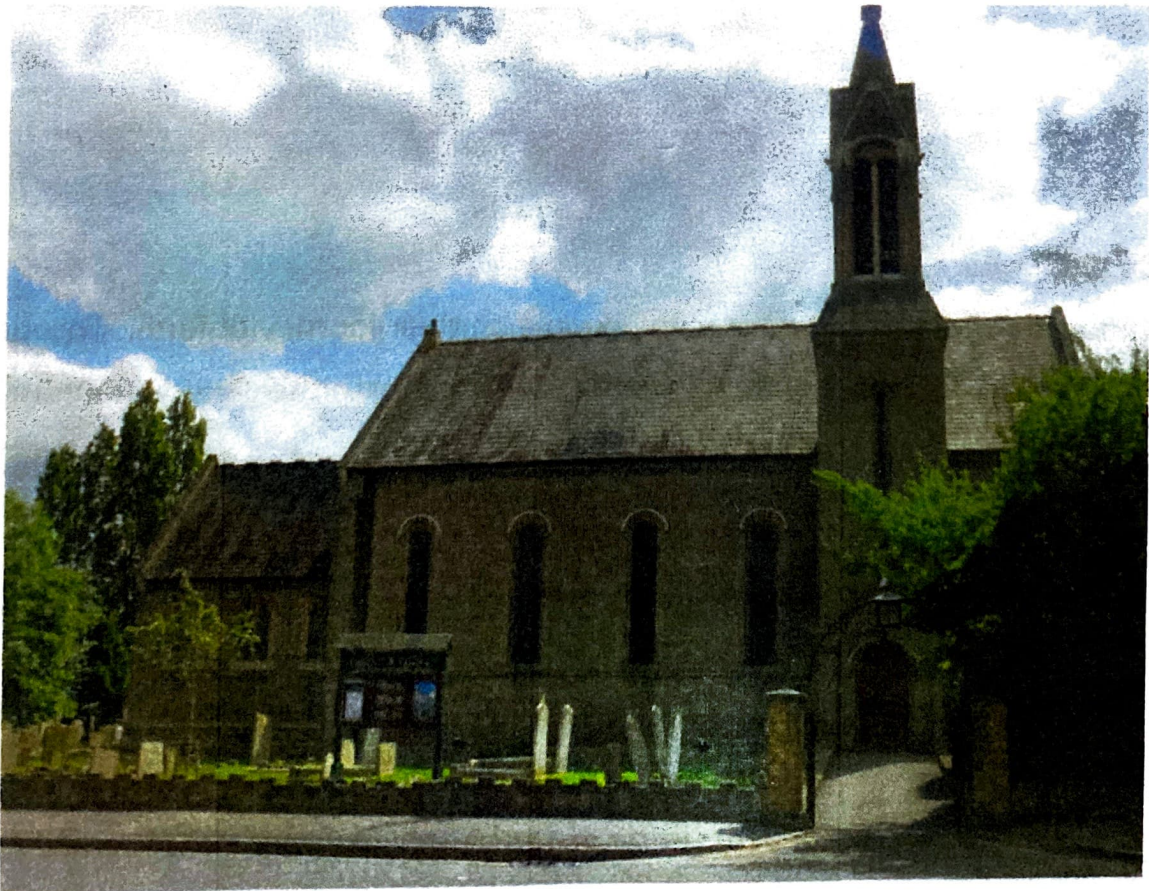
Holy Trinity Barkingside Parish Church

Each meditation tells you a little about the church, and then gives you a Bible verse to read and a prayer to say.